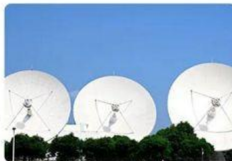
Communication base station monitoring power supply system