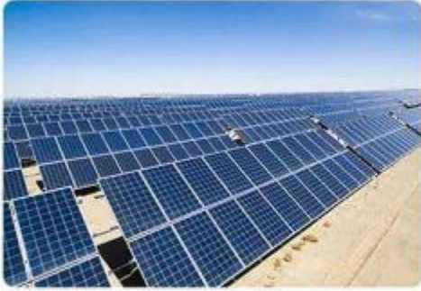
PV power station system

Home PV,RV power supply,PV power station,Base station power supply system