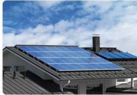
Home PV system