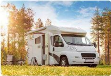
Power supply for motorhomes and ships